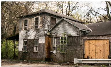
Paul Schmetzer Road House