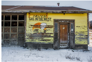
Bob Dorzback Old Gas Station