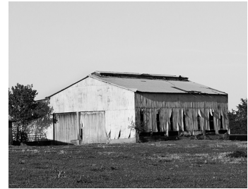
Robbie Sherrard Old White Barn