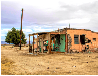
Carolyn Hawkins Home at Bombay Beach