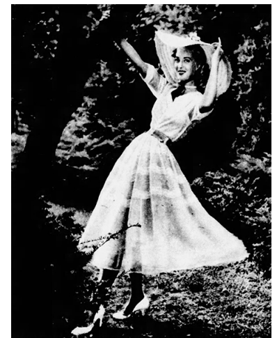
This photo, "Spring Vivacity," was accepted and displayed at the 1952 Louisville International Salon (C-J, 2-22-53)