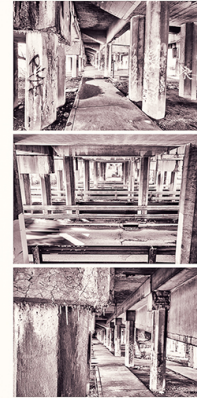
Robert Klein Underpass