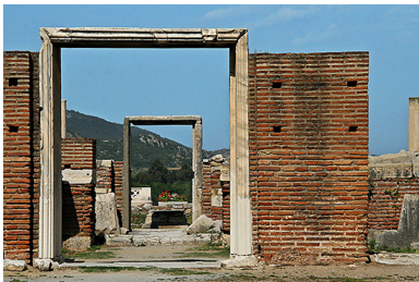
Basilica of St. John, Ephesus