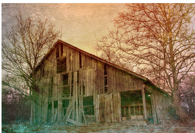
Deborah Brownstein Old Barn