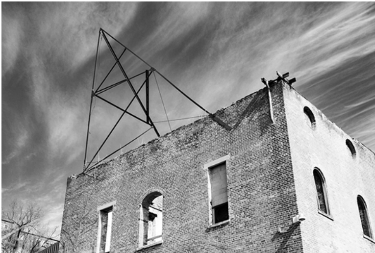
2nd: Reed Bagley To the Point