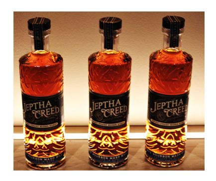
Greta Garbo Bourbon