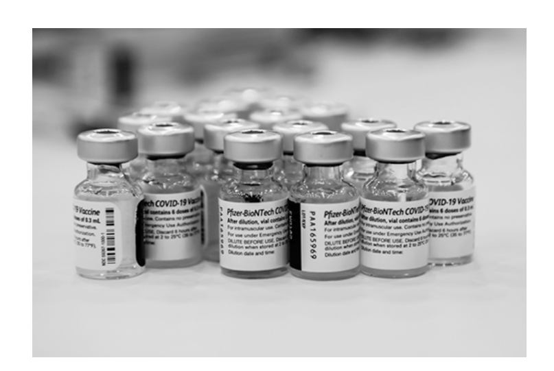
2nd: Bob Dorzback Covid-19 Vaccine Bottles