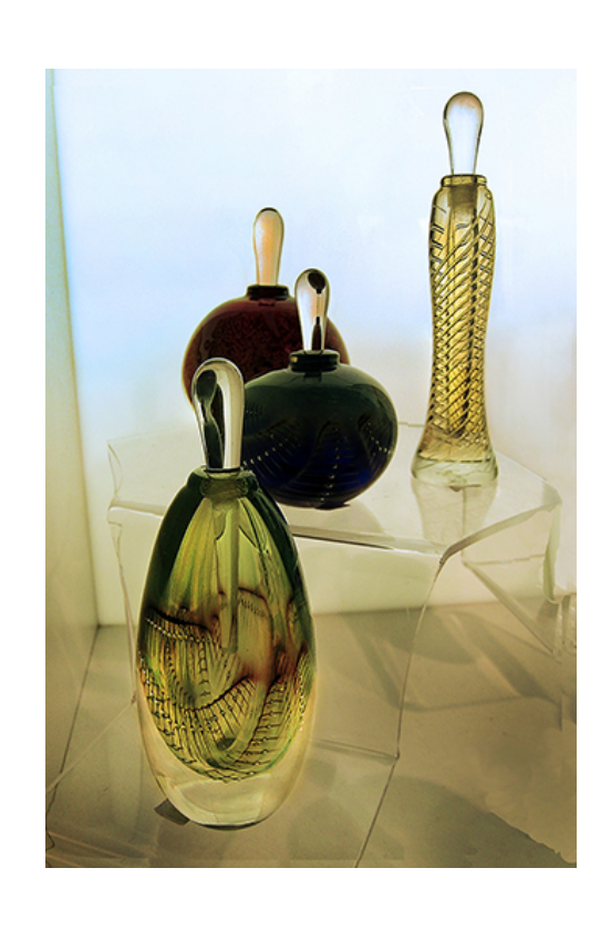
2nd: Kay Sherrard Sweet Perfume