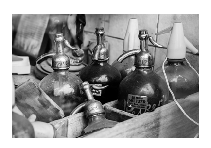
Bob Dorzback Old Seltzer Bottles