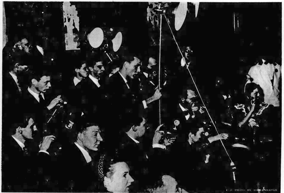
ONE CAMERA to every three people (or maybe it was the other way around) came to the first get-together for Louisville camera fans Monday night. Held at the Plantation, it was sponsored by the Louisville

Movie Club. On all sides were photographers taking pictures of photographers taking pictures of—here's where we came in. About 275 attended. Those fellows above are snapping the floor show.