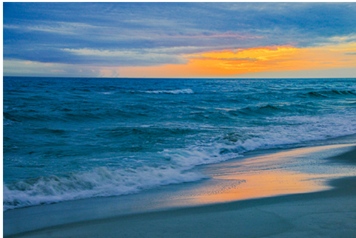
2nd: Tom Barnett Sunset Beach