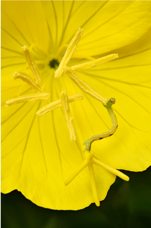
Inchworm on Primrose

An inchworm feeding on the pollen of an Evening Primrose.