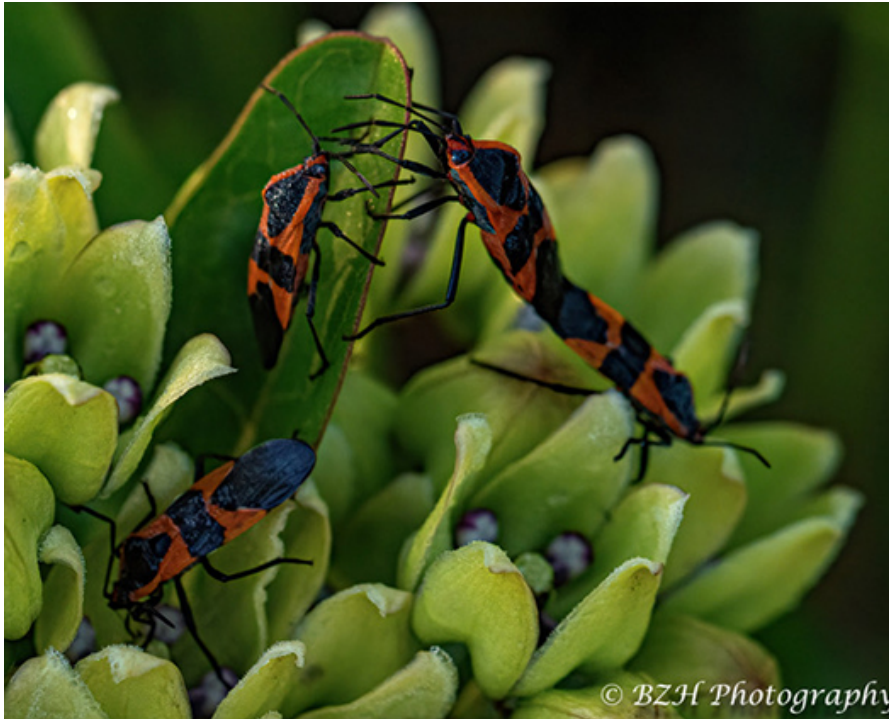
Box elder bugs

I am continually working on my Macro/close-up skills. All photos this month were taken handheld with my Tamron 90mm on my Nikon D5500. I love the variety of bugs/flies and the colors in nature. I probably should be using a tripod, but all but one of these shots were taken during my morning walks, so carrying a tripod might be awkward.