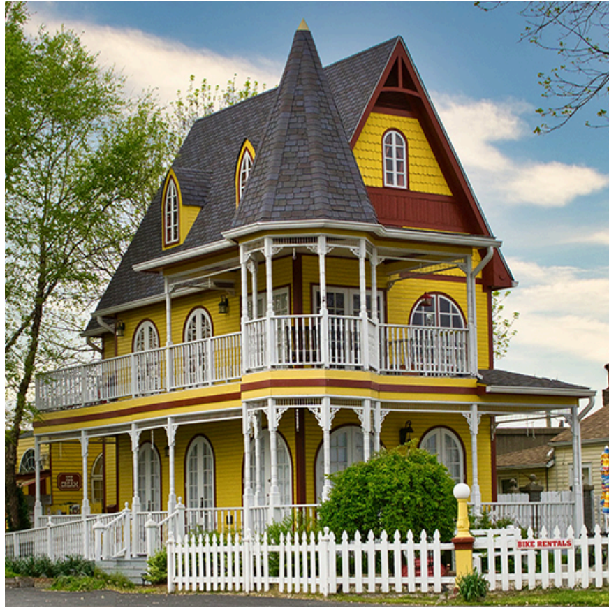
Bright House Ice Cream Shop

Located along the Ohio River on the Indiana side. They sell ice cream here during the summer. I have heard it is great.