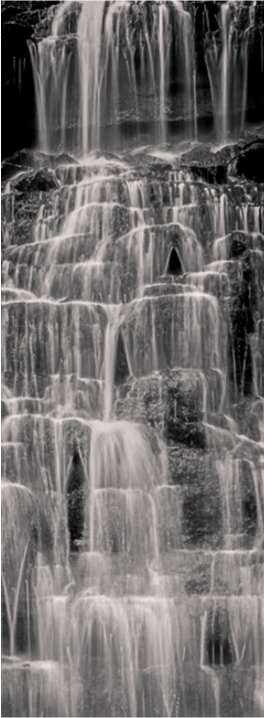
Waterfalls in Cove Springs Park, Frankfort