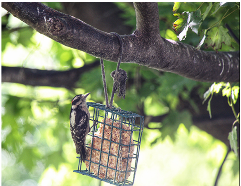
Hairy woodpecker; we have these most of the year