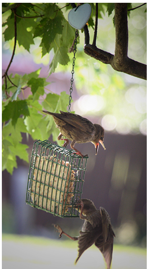
Birds squawking on the suet feeder