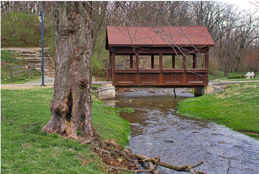
Walking Bridge in Greenway Park

Located along the Ohio River on the Indiana side. They sell ice cream here during the summer. I have heard it is great.