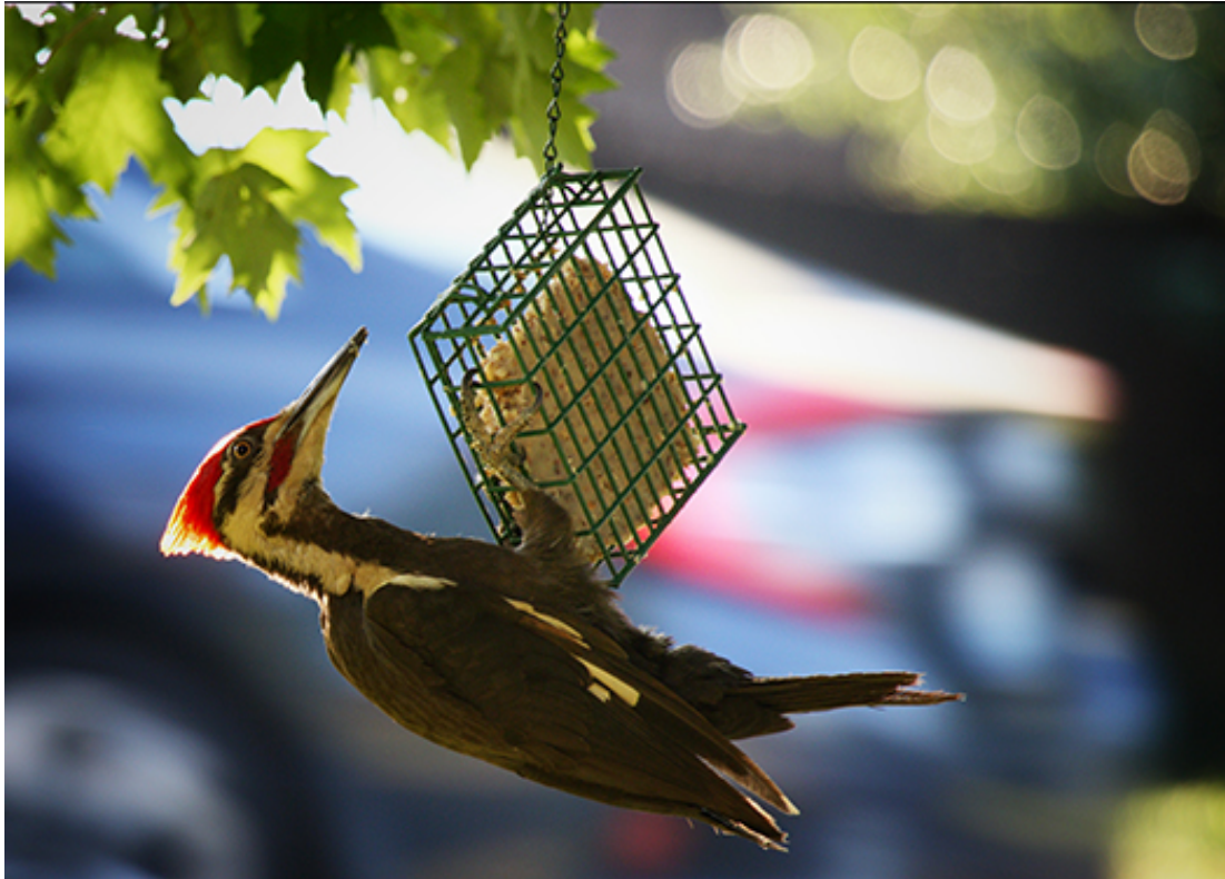
Pileated woodpecker on my suet feeder; he showed up almost every day for a week and a half