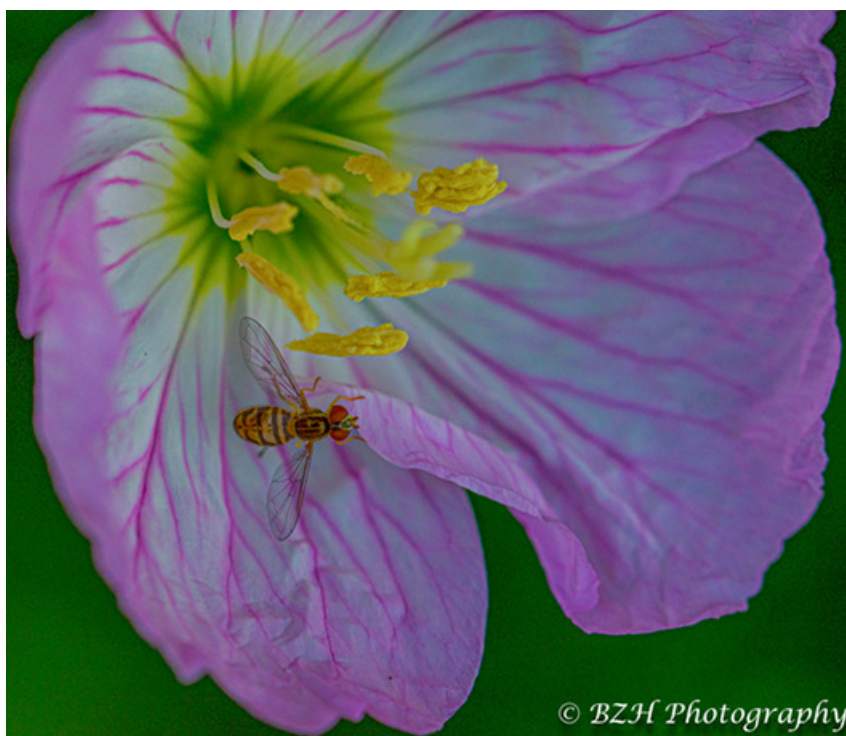
Bug on primrose