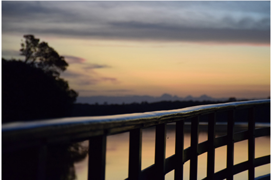
On the River

More Brazil photos, many from floating down the Amazon River.