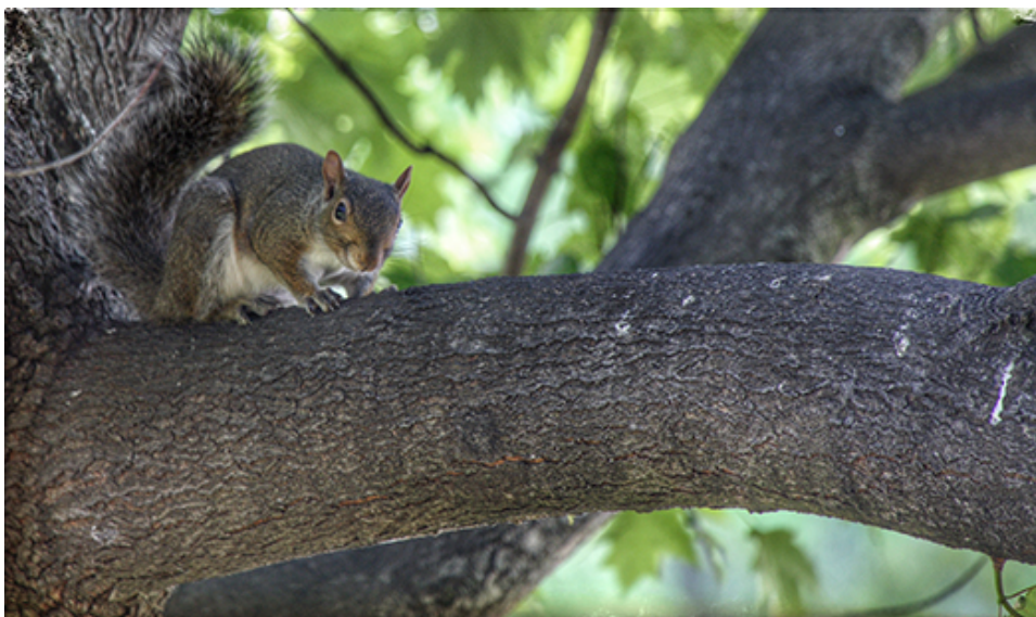
Squirrel on my maple tree