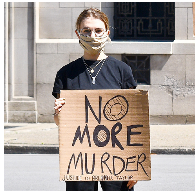
No More Murder

Rioters broke one side of this display window at Louisville's Omni Hotel. I took the image on Saturday morning May 30th just before the rest of the glass was knocked out and cleaned up.