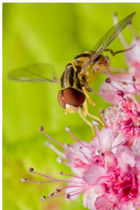
Tiny Bee, Big Eyes

A Siberian Iris captured on an overcast day between rain showers.