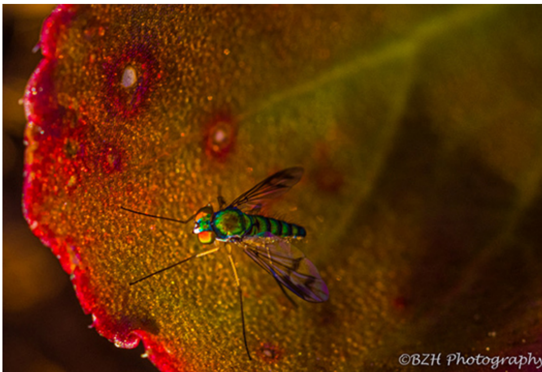
Fly on flower