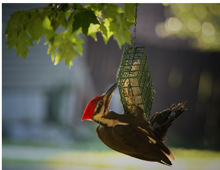
Pileated woodpecker having dinner