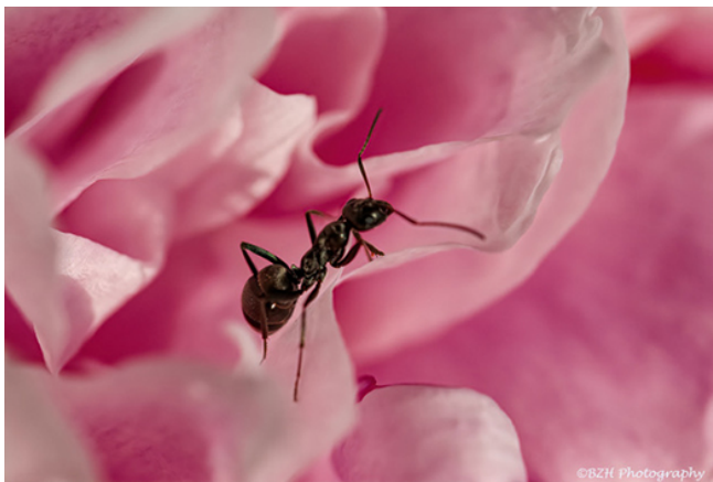
Ant on peony