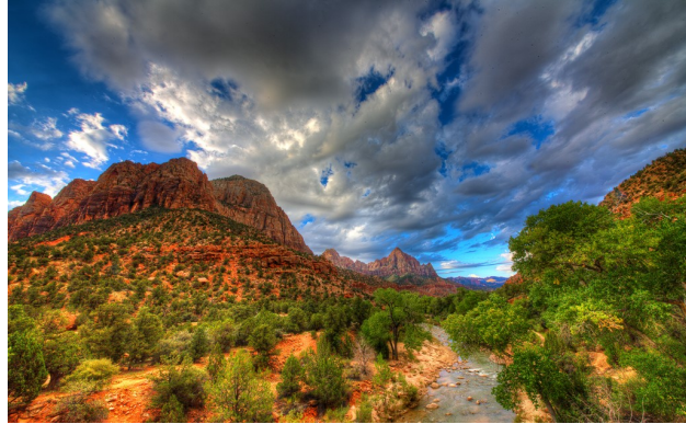
2nd Place—Gertrude Hudson “Moraine Lake, Canada”