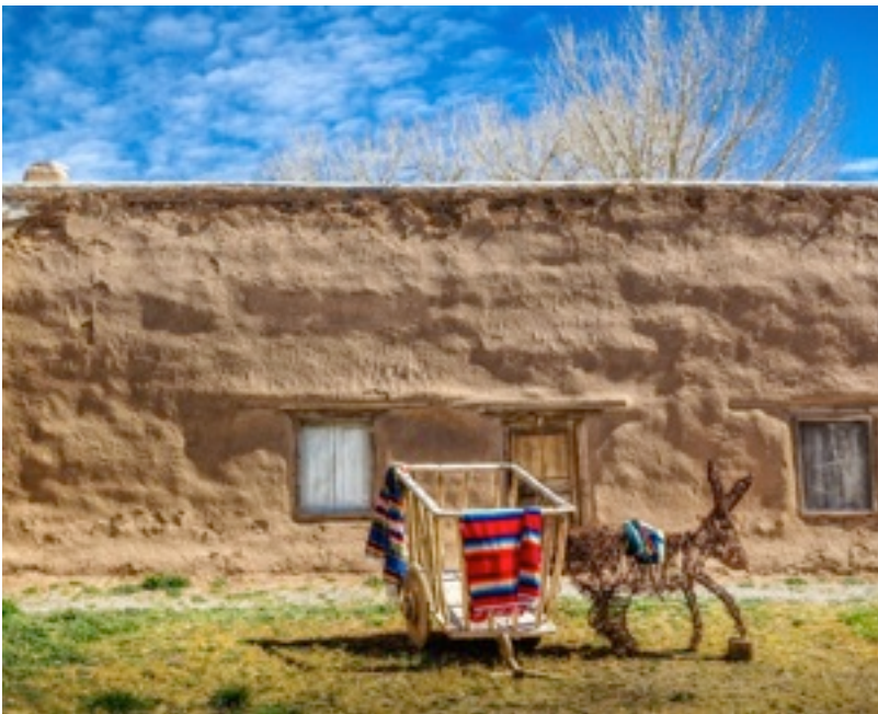
Hacienda Martinez at High Noon