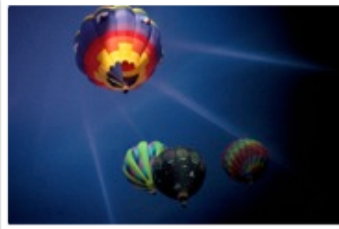
Balloons in Flight