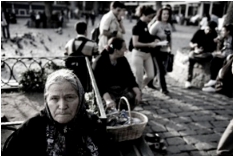
Turkish Street Scene

Well known photographer Dan Dry will present " The Power of the Image, finding your own vision " at 7:30 PM, Wednesday, June 12th at Outdoor Photo Gear in Louisville.