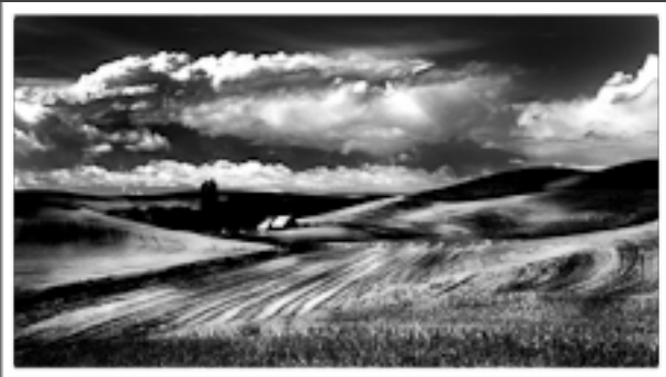
Bob Wells 1st Place and

Best Monochrome Photo of Show Class 62 (Aspiring) Monochrome-Our Seasons Inspire Us