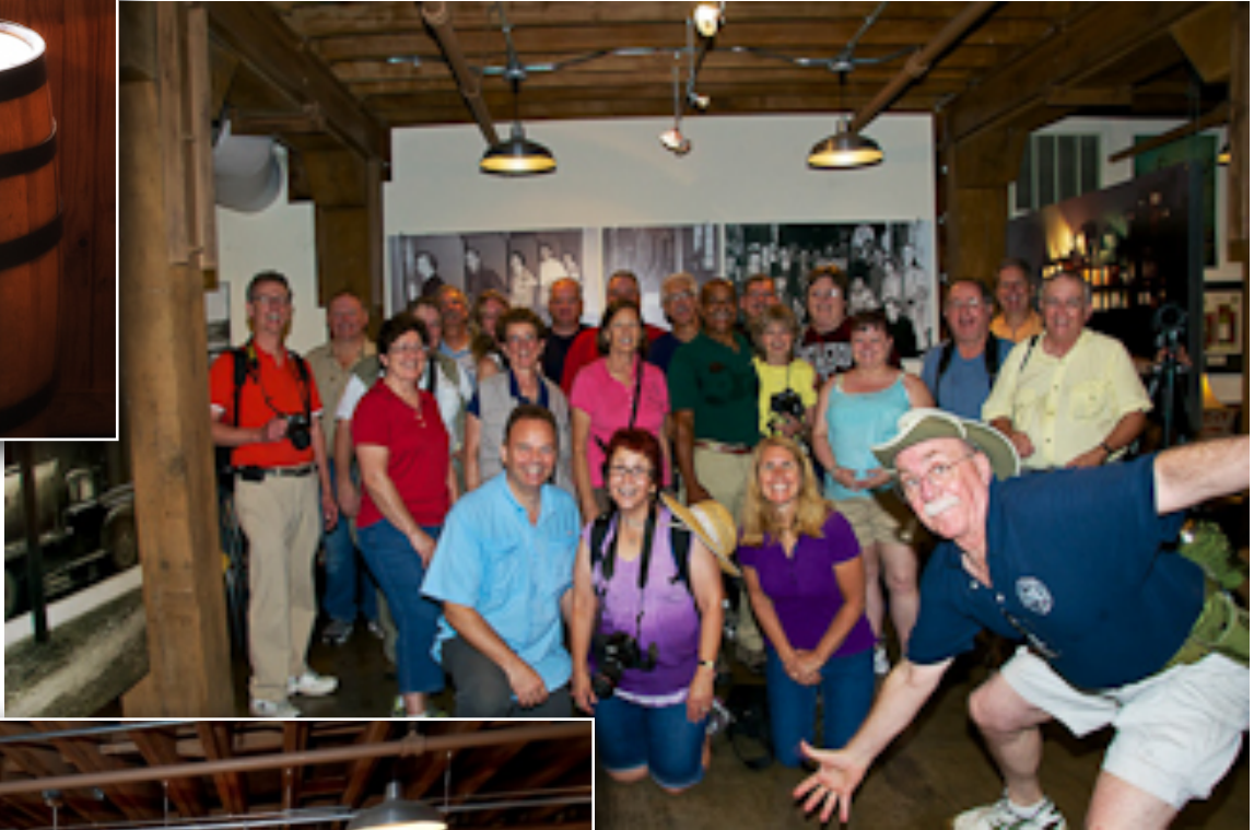
Fast time delay