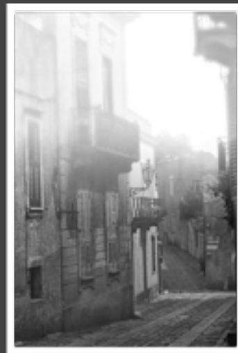
Debbie Brownstein 3rd Place

Best Monochrome Photo of Show Class 62 (Aspiring) Monochrome-Our Seasons Inspire Us