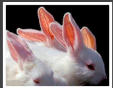
T.Y Huang 1st Place

Class 80 (Aspiring) Monochrome- What is Digital?