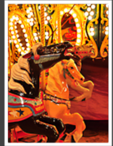
Jim Ofcacek 3rd Place

Class 73 (Aspiring) Color 2011 KY State Fair Digital