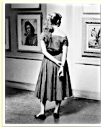
2011 Kentucky State Fair Class: People Portraits Honorable Mention